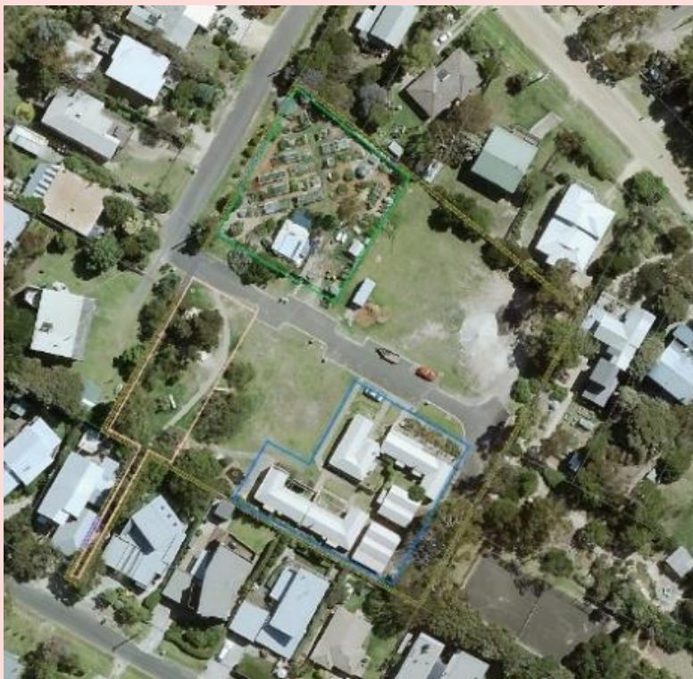
2 Fraser Drive, Aireys Inlet